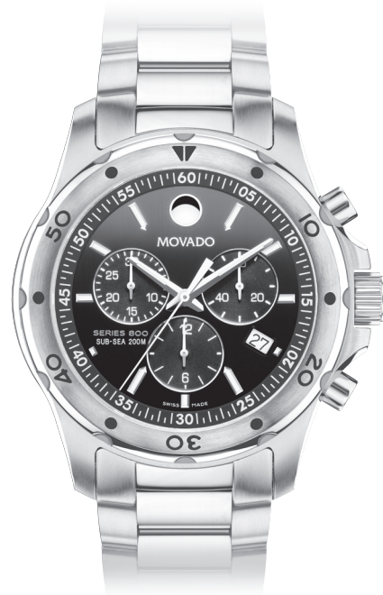
Available at Diamonds International and Harry Edwards Jewelers